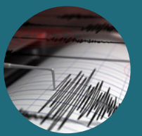
Earthquake Engineering & Design