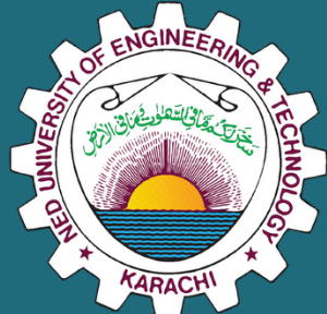
Department of Civil Engineering NED University of Engineering & Technology