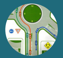
Traffic Simulation and Modeling