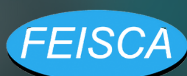
Federation Of Engineering Institutions of South & Central Asia (FEISCA)