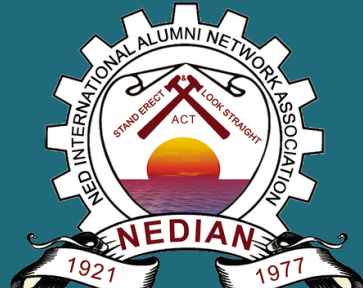
NED International Alumni Network Association Pakistan