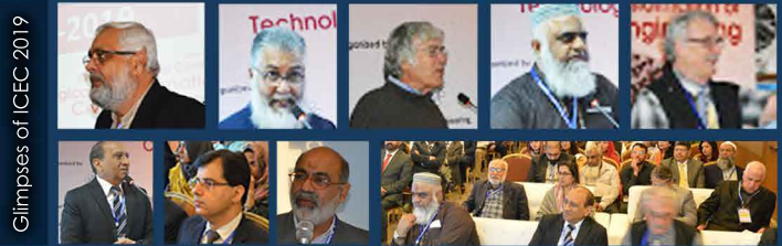
Glimpses of ICEC 2019